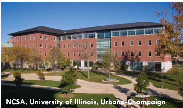
NCSA, University of Illinois, Urbana-Champaign