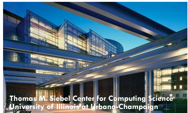
Thomas M. Siebel Center for Computing Science University of Illinois at Urbana-Champaign