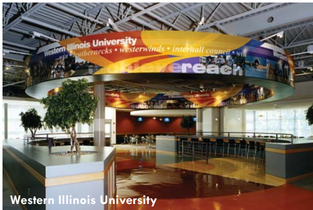
Western Illinois University