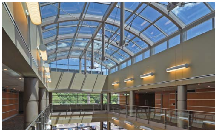
University of Illinois, College of Medicine at Rockford