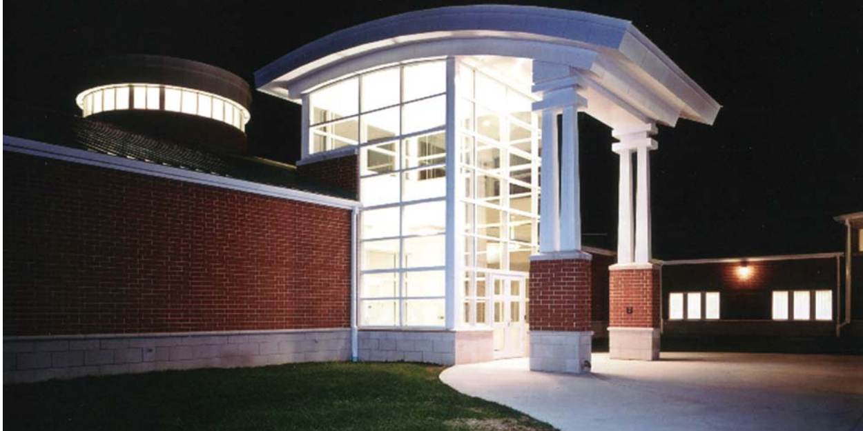
Monticello Middle School - Monticello CUSD 25

For almost 50 years, K-12 projects for both public and private schools have been a staple of our practice. Larson & Darby Group has delivered inspired design solutions for over 250 school projects for Illinois school districts ranging from Ashton to Wheaton and from new elementary, middle and high schools to gym and classroom addition/renovation projects. Our approach to school design begins with the needs of students, staff, and the greater community. Our understanding of educational environments and trends, coupled with your input, results in an attractive, secure, cost-effective, and user-friendly educational facility that contributes to your community for generations to come.