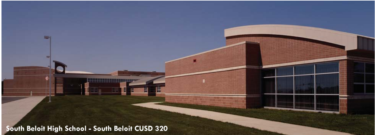
South Beloit High School - South Beloit CUSD 320