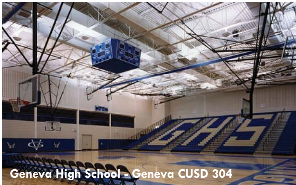
Geneva High School - Geneva CUSD 304