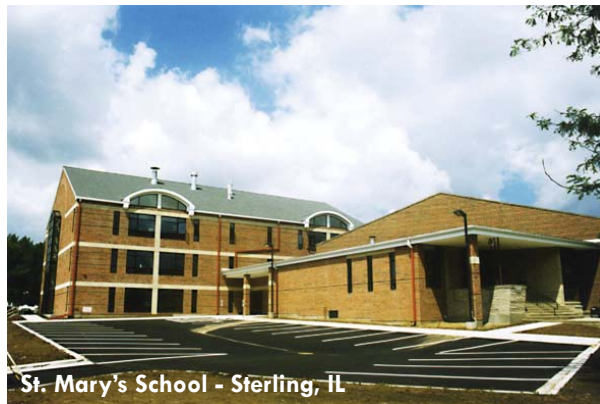
St. Mary's School - Sterling, IL