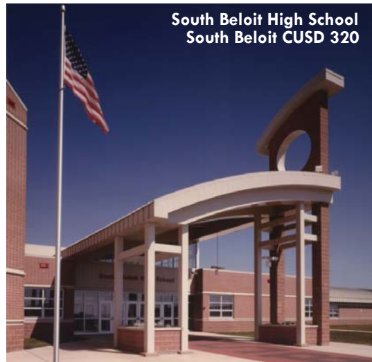
South Beloit High School South Beloit CUSD 320