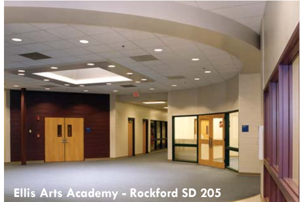
Ellis Arts Academy - Rockford SD 205